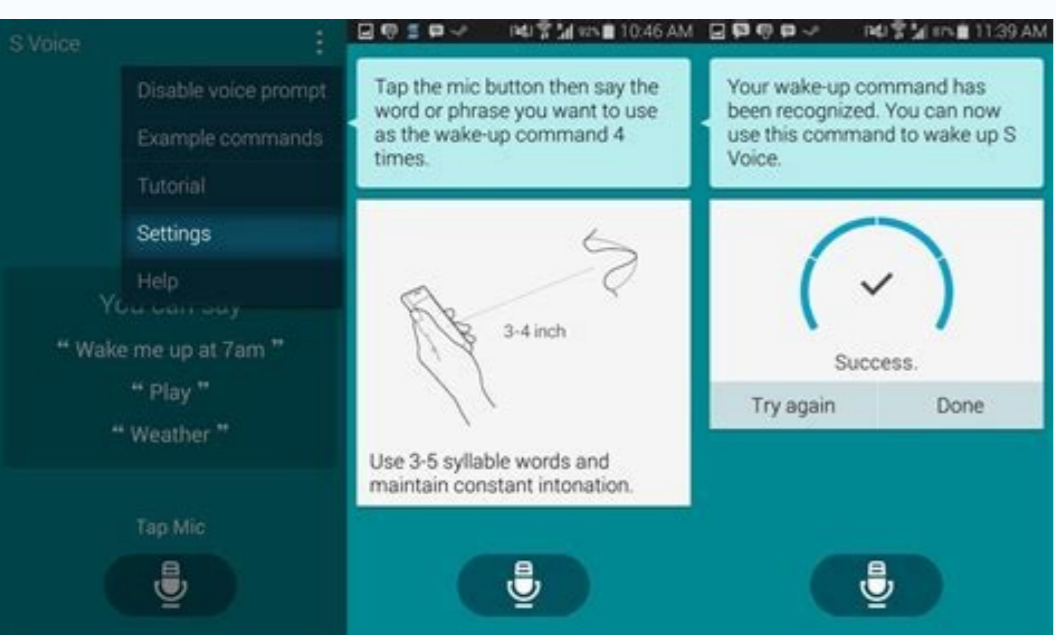
What is voice command on android. Adding voice commands to android app. Custom voice commands. Do android phones have voice command.